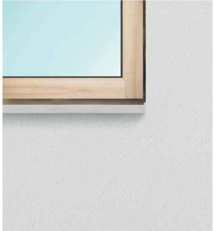
PROGRESSION internal view