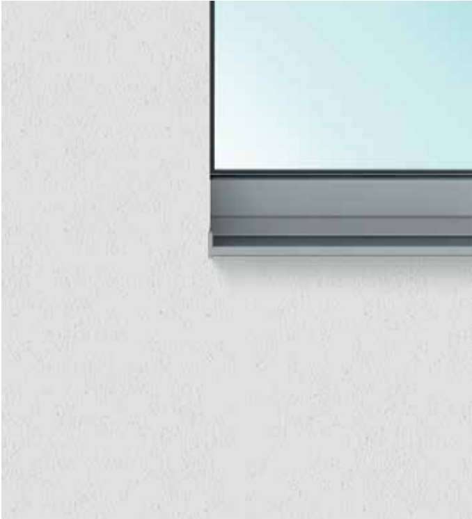
PROGRESSION external view